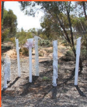
On the Verge by Curdnatta Art Group (2nd Prize Arid 2014)