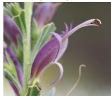
Eremophila glabra ‘Augusta Storm’