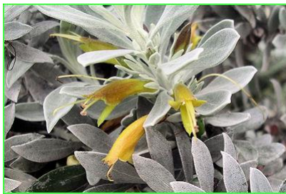
Eremophila Kalbarri Carpet