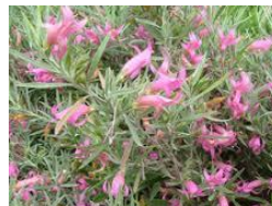
Eremophila gilesii x latrobei ‘Yanna Road’