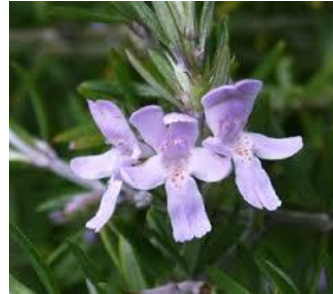
Westringia 'Wynyabbie Gem'