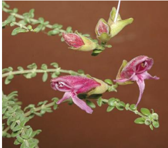
Prostranthera serpyllifolia ssp microphylla

Xanthorrhoea quadrangulata - slow growing grass like shrub, tall flower spikes from autumn to winter