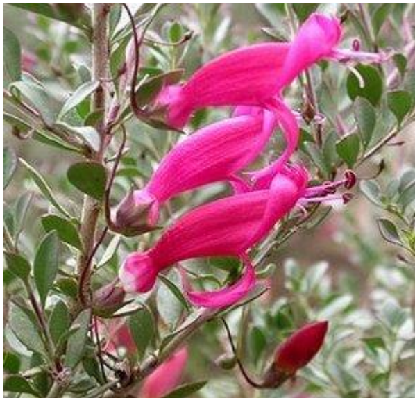
Eremophila maculata var brevifolia

****Plants become the responsibility of the customer as soon as they leave the nursery and we accept no responsibility whatsoever as to loss or damage particularly delays in the delivery of orders as they are beyond our control. ****